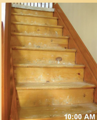
Before and after — a new staircase in just six hours!

For more information, visit www.starecasing.com .